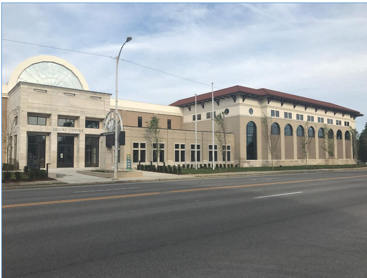
The Moore Center