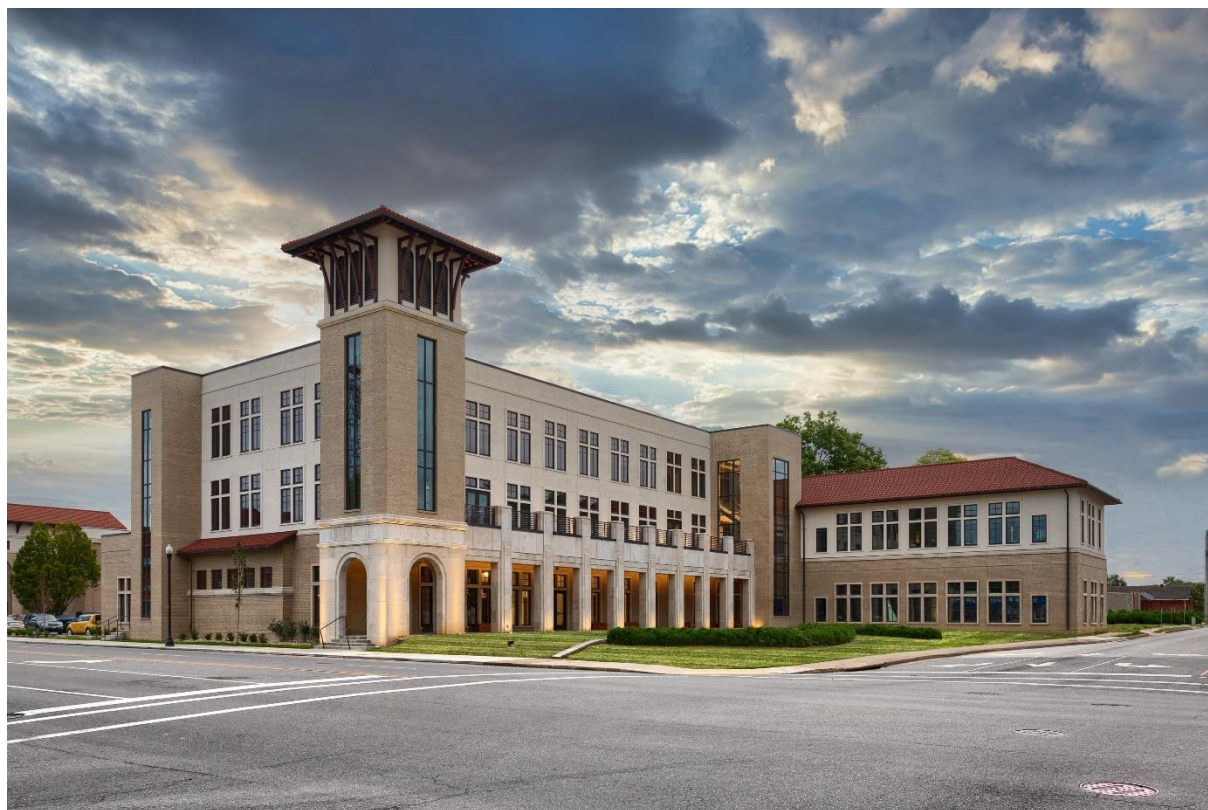
The C.E. Field Center for Professional Studies