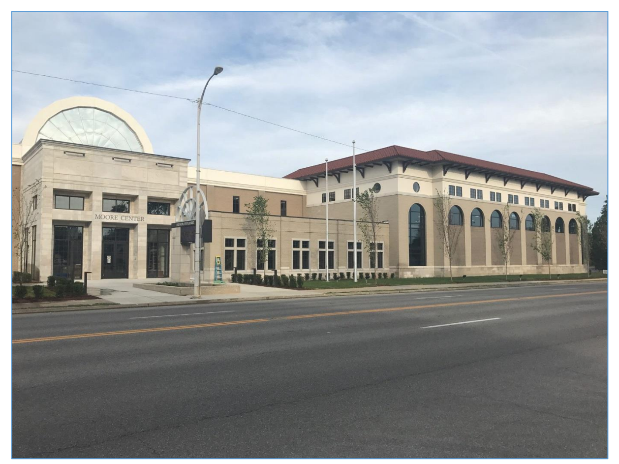
The Moore Center