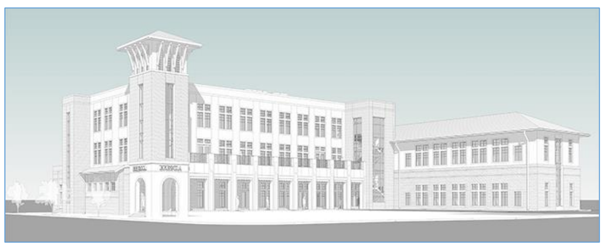
The C.E. Field Center for Professional Studies