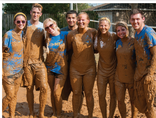
Students are all smiles enjoying what has become a favorite tradition of homecoming week, the mud volleyball tournament.