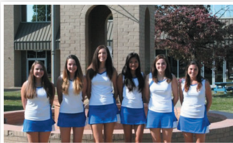
The 2015 Women's Tennis team finished their season with a 5-6 record.