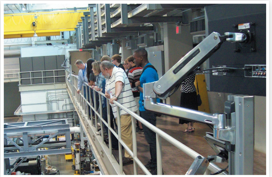
Students and faculty take in the Oak Ridge National Laboratory facility in Knoxville.