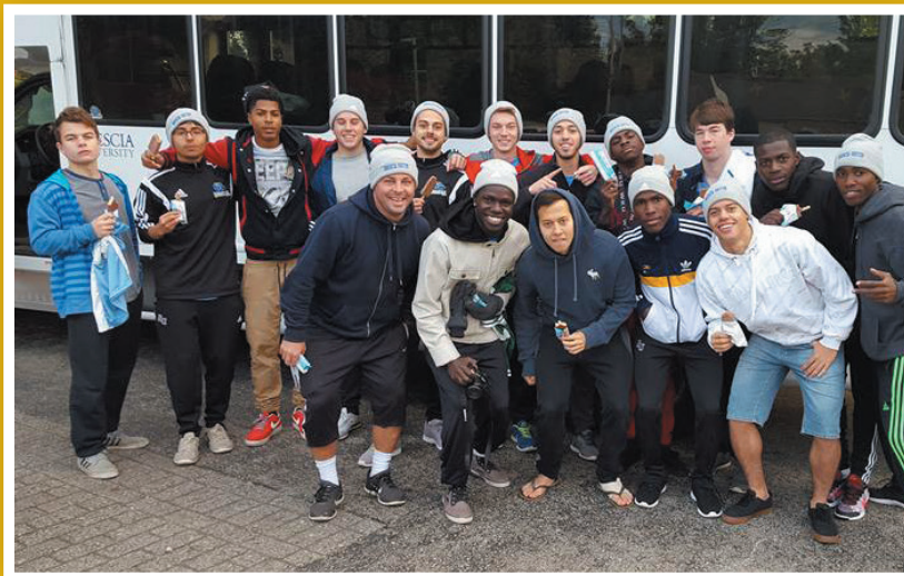
The Men's Soccer team pauses for a photo during travel for an away game.

Be sure to sign up for their SMS subscription and follow them on Facebook & Twitter.