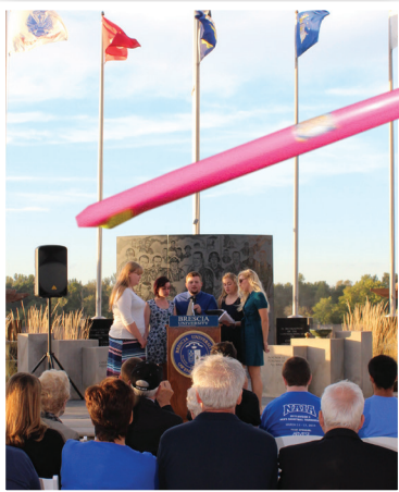
Members of the Brescia University Student Choir performed for those gathered for the 2015 Veterans Homecoming Ceremony.