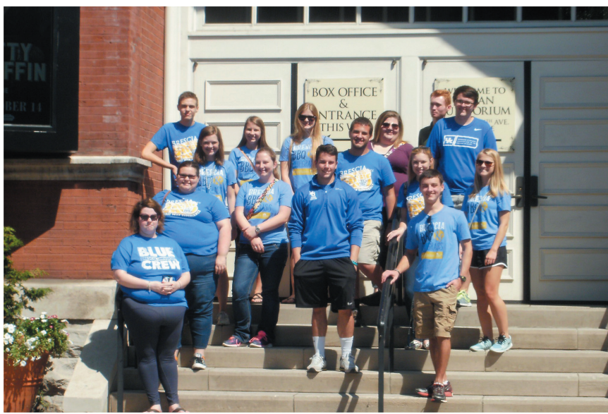
Students pose in front of the hallowed walls of the Ryman Auditorium, country music sacred grounds.