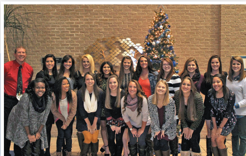
The Women's Soccer Team celebrated at their season ending soccer banquet with nearly 60 people in attendance. Recognition awards based on seasonal performance were presented to players.