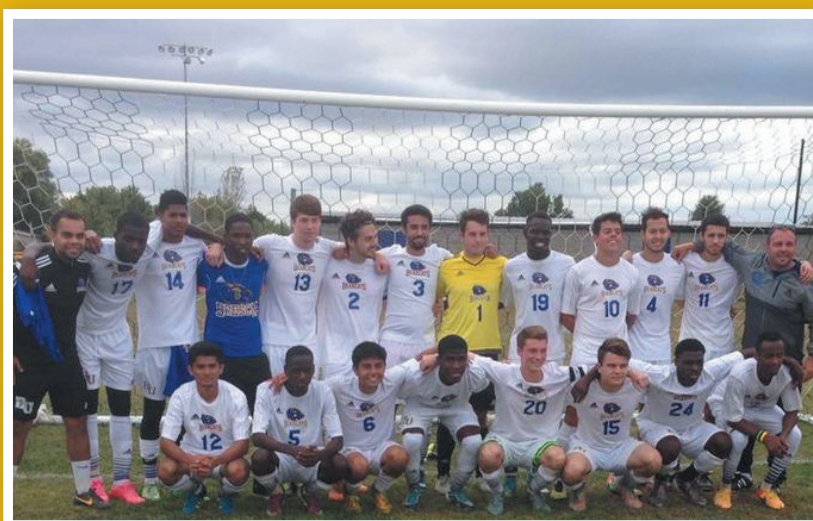
The Men's Soccer team celebrating their first season victory.