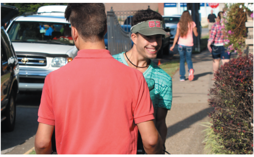
The campus was busy with students and families moving into the dorms.