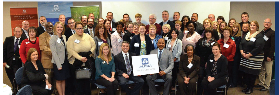
Representatives of the Alcoa Foundation pose with recipients of the grants they provided to local organizations to help aid in supporting improvements to education and protecting the environment.

A $432,227 grant will establish "Living and Leading with Love," a program that will provide Catholic high school students with a combination of theological reflections, online learning experiences, service opportunities, and social functions for the duration of one academic year; the culmination will be a ten-day, intensive on-ground experience at Brescia University.