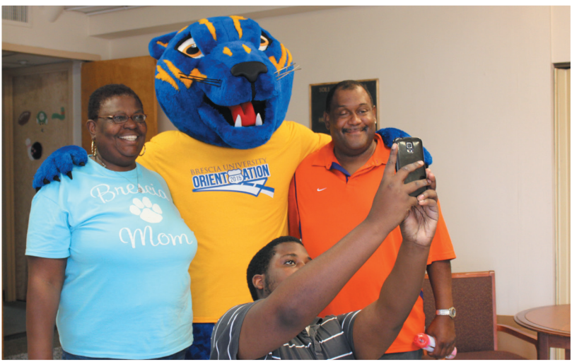
Family members take a quick break from moving to snap a selfie with Barney.