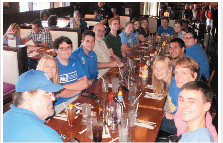
Students take in the local cuisine of Nashville before continuing on their journey of the Country Music Capital.