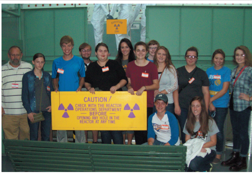
Students learn about the historical impact of the work at the Oak Ridge National Laboratory.