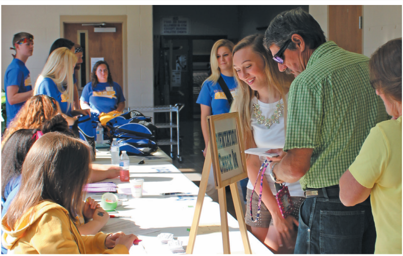
Students and their families arrive at campus for registration day.