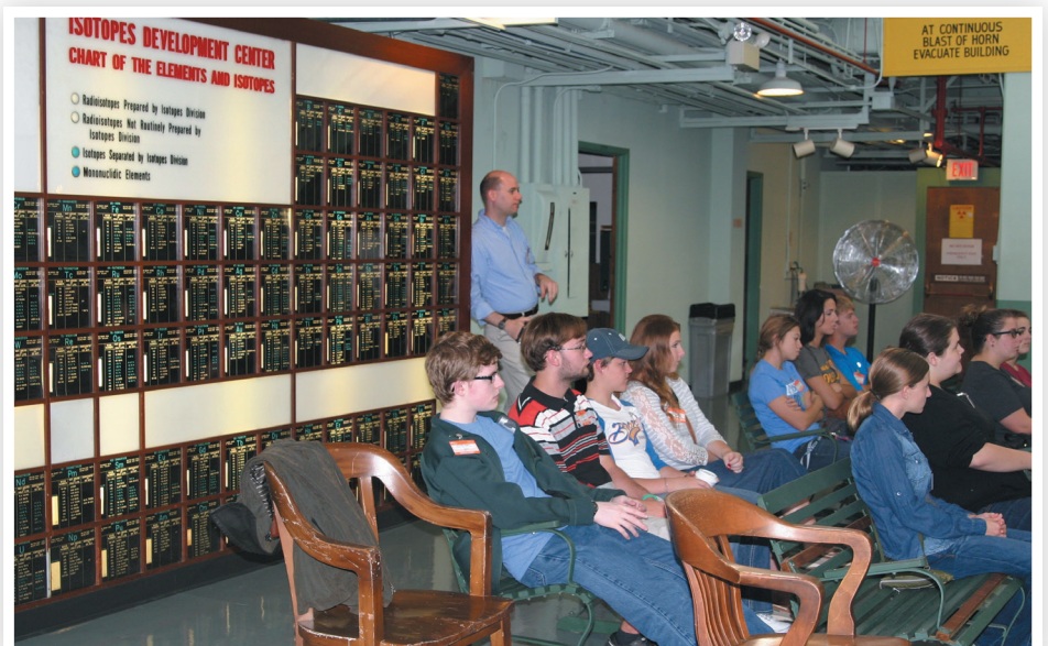
Students stop in the Isotope Development Center to learn more about the history of the Oak Ridge National Laboratory.