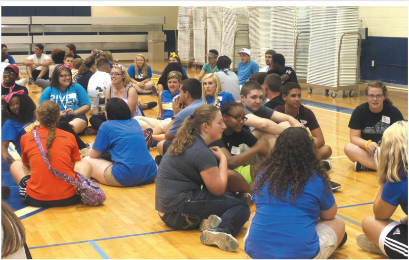
Students participate in icebreakers as they get to know their fellow classmates and orientation leaders.