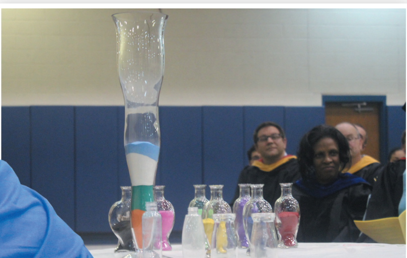
Incoming freshmen use sand to represent the various states and countries they hail from to create their unity display.