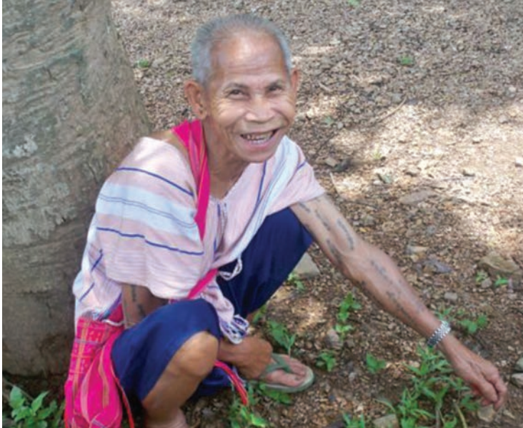
Man in Sop Moe refugee camp in Northern Thailand.