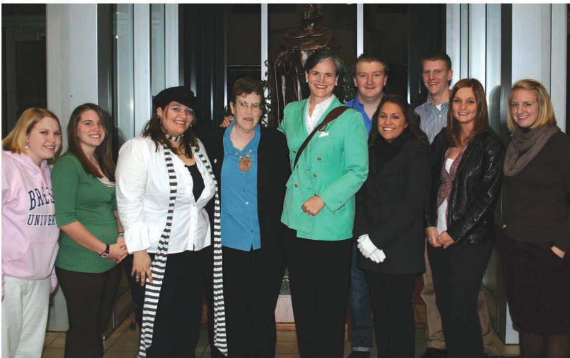
Tori McClure (center in green jacket), author and first woman to row solo across the Atlantic Ocean, spoke to students in November 2009.