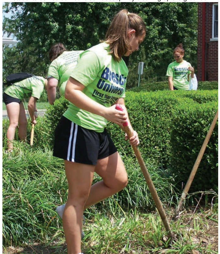
Students served at Mount Saint Joseph by cleaning up the grounds.