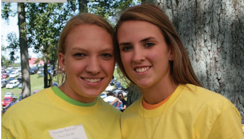
Brescia students served at the annual Mount Saint Joseph Picnic by working a booth and parking vehicles.

New Student Orientation takes place this year August 21-24. BU101 classes will begin that week, imparting the Brescia mission and tradition into a new generation of students.