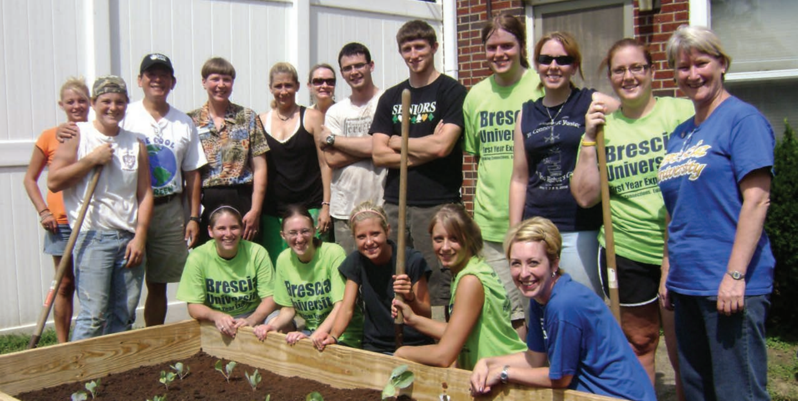
Brescia students served at the OASIS Shelter by building and planting a raised garden.