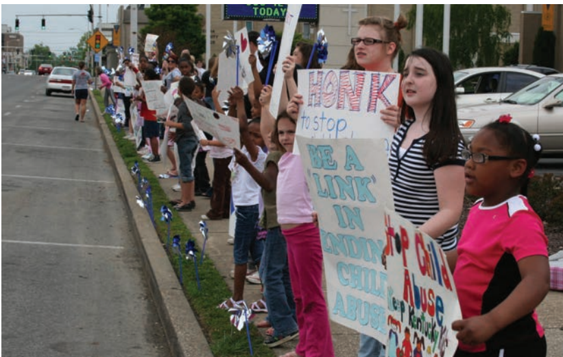
Below: Students and faculty joined girls from Girls, Inc. to raise awareness about child abuse.